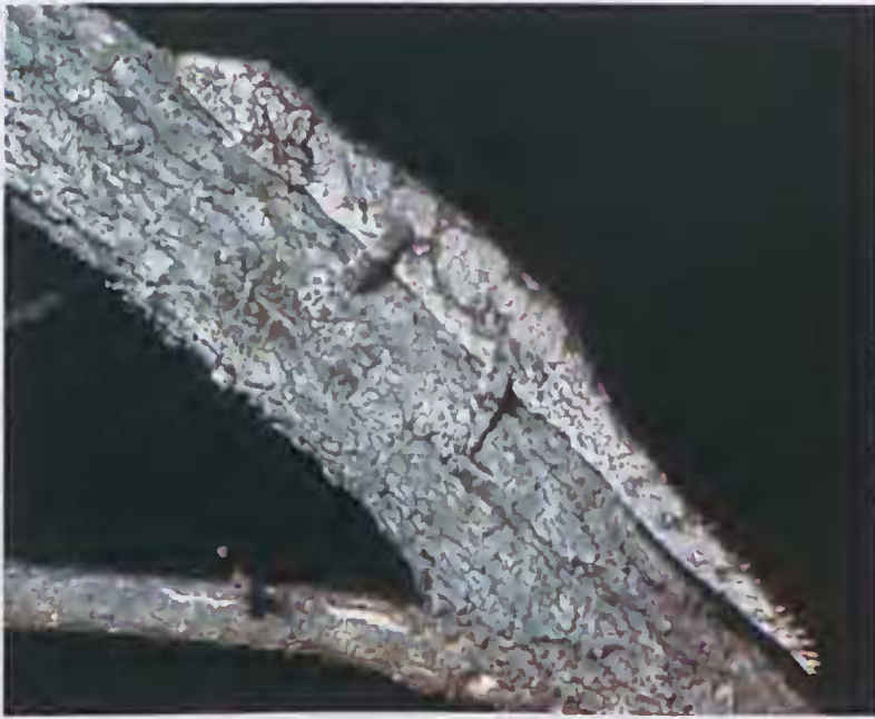
FIG. 2. Strophurus krisalys sp. nov. (AMSR143902) from near Normanton, Qld.

dorsal mid-line of the body (vs a single row each side of the dorsal mid-line of the body), and partially (vs completely) divided rostral scale.